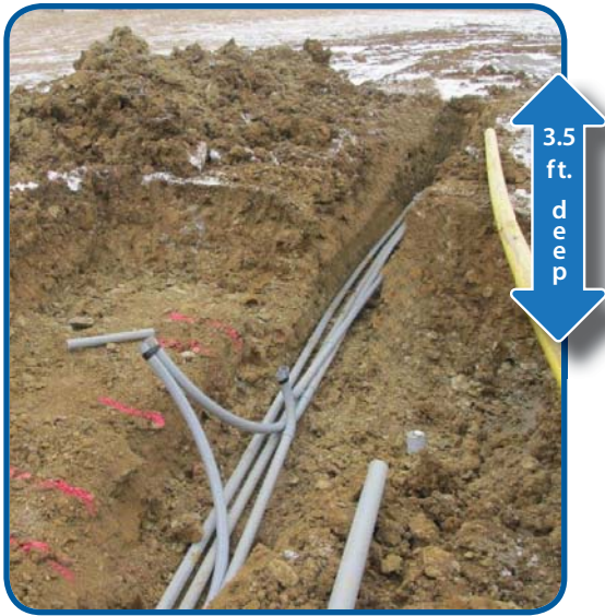
Ditch shall be 42 inches deep minimum and free from rocks/sharp objects.