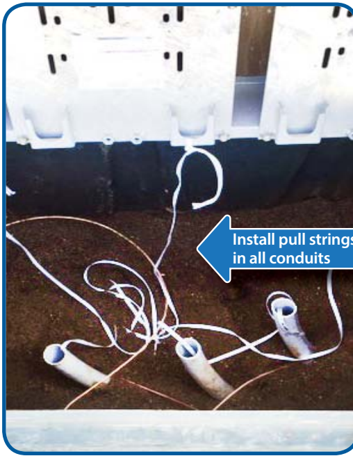
Install pull strings in all conduits