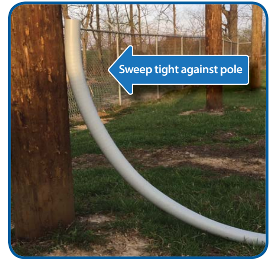
Sweep tight against pole