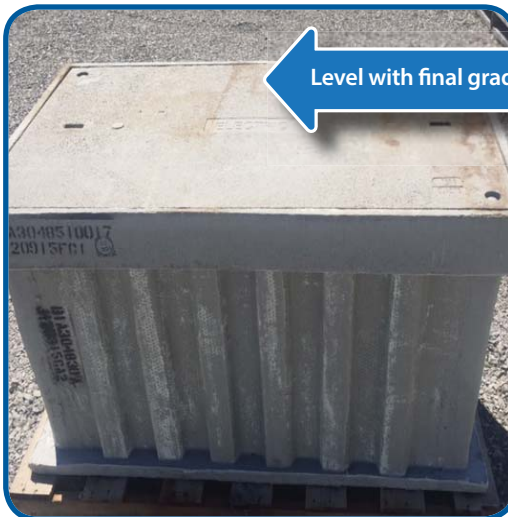
Level with final grade